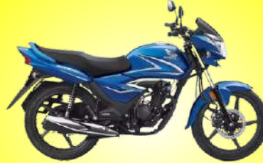
HONDA BIKE PEARL