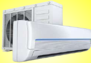
AC (Air Conditioner) PLATINUM