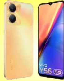
ANDROID PHONE SILVER