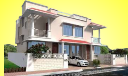
1400 SQ FT. BANGLOW CROWN DIAMOND