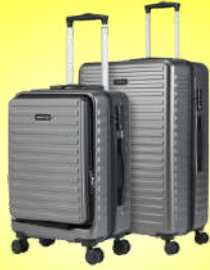
TROLLY BAG CLASSIC