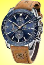
WRIST WATCH BASIC