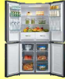
DOUBLE DOOR FRIZGE GOLD