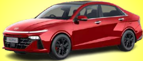
HUNDAI VERNA DIAMOND