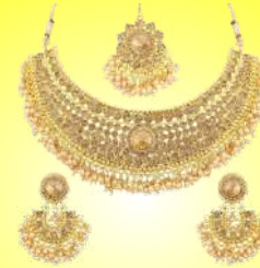
JWELLERY GIFT EMERALD