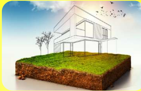
2000 SQ FT PLOTS ROYAL DIAMOND