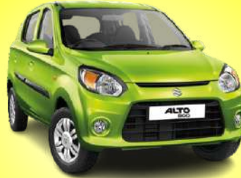
MARUTI ALTO RUBY